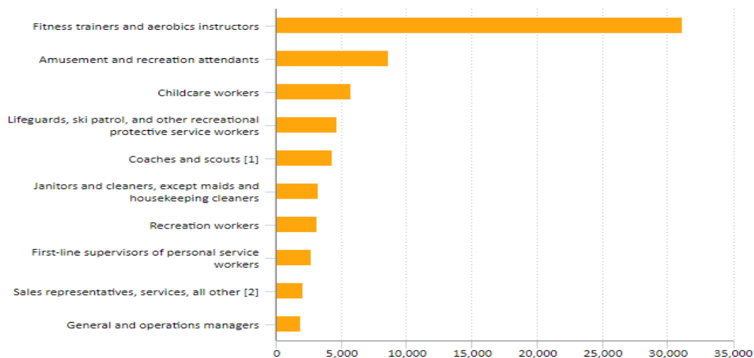
Chart 1. Occupations with the most new jobs in fitness and recreational sports centers, projected 2018–28

General and operations managers in fitness and recreational sports centers had a median hourly wage of $33.04 in 2018, the highest for the occupations shown—and more than triple that of lifeguards, ski patrol, and other recreational protective service workers , which at $10.35 had the lowest industry wage for the occupations charted. These managers usually work full time, year round. But part-time, seasonal jobs are common in many of the other occupations in the chart, which is why it shows hourly, instead of annual, wages.